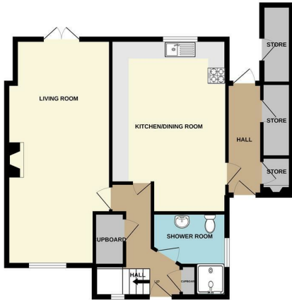
GROUND FLOOR 808 sq.ft. (75.1 sq.m.) approx.