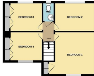
1ST FLOOR 408 sq.ft. (37.9 sq.m.) approx.